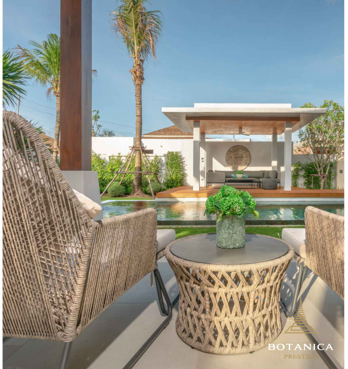
SIGNATURE Tropical Balinese