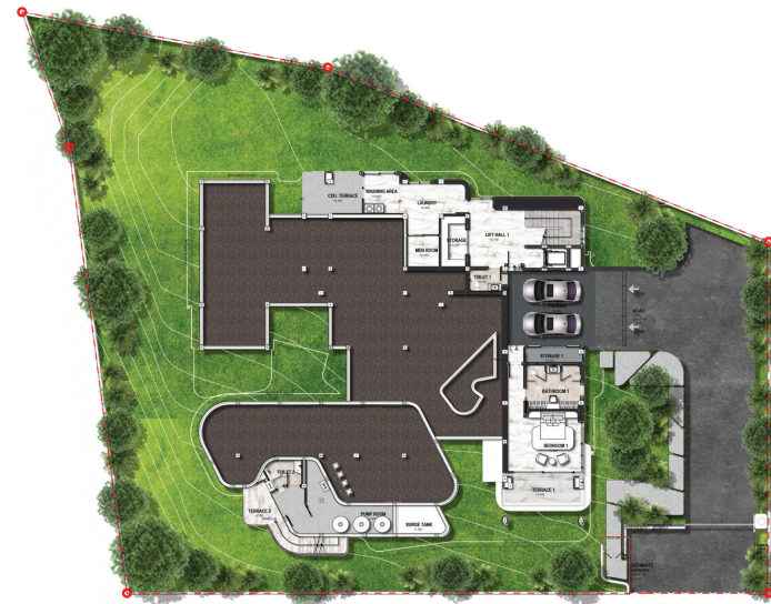
Basement Level Plan

DISCLAIMER: WHILST EVERY CARE HAS BEEN TAKEN IN PREPARING THE SALES INFORMATION AND ARTISTS' DIGITAL AND ARTISTIC IMPRESSIONS IN THIS BROCHURE, THE DEVELOPER DOES NOT GUARANTEE THEIR ACCURACY NOR INTENDS THEM TO FORM ANY PART OF AN OFFER OR CONTRACT. THE DEVELOPER ALSO RESERVES THE RIGHT TO MAKE CHANGES TO THE RESIDENCE DESIGNS PRESENTED HEREIN AT ANY TIME, AT ITS OWN DISCRETION AND WITHOUT PRIOR NOTICE TO PROSPECTIVE BUYERS.